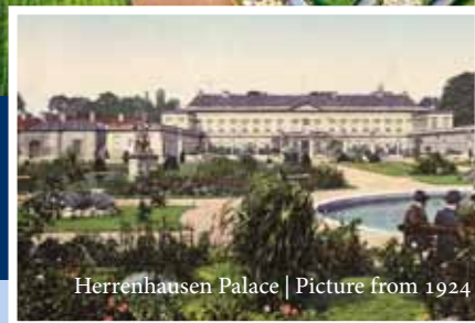
Herrenhausen Palace | Picture from 1924