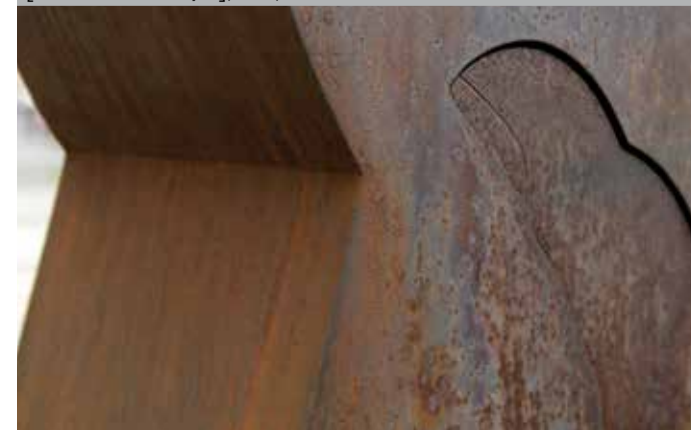
Horst Antes »Kopf in der Hand« [Head in Hand] and »Kopf mit zwölf Augen« [Head with Twelve Eyes], steel, installed 1981.