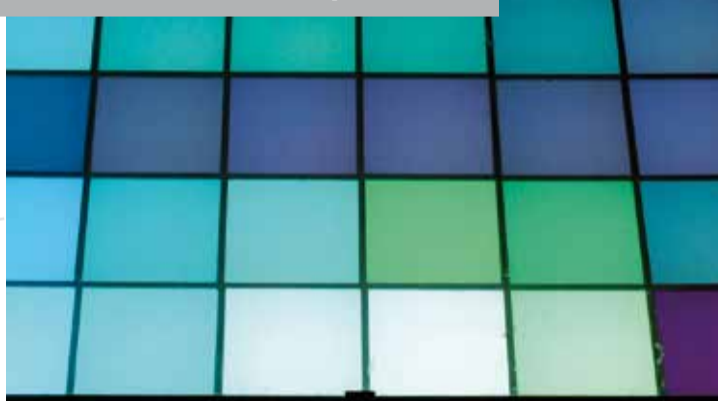
Angela Bulloch »Pacific Rim Around & Sideways Up« monitors, installed 2002.

3 In 2000, the NORD/LB bank tendered a competition for its new building on Aegidientorplatz, in conjunction with which a commission of experts selected five projects by internationally renowned artists. The piece by Angela Bulloch (b. 1966 in Rainy River, Canada) installed on the façade is the only one of them that can be viewed without entering the building's grounds. During the day, the five times thirty quadratic monitors blend into the structure of the architecture as a vertical reference; at night, however, they gain visual significance through the subtle flowing of ever new colour combinations. The artist's dealings with the functionality and ordering principles are focussed here on movements in an urban society: restricted, but complex and dynamic, suggesting transitions, alluding to structures, but hardly comprehensible through mere observation. The piece belongs to the NORD/LB Art Collection.