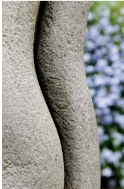
Otto Almstadt »Kontakte« [Contacts], sandstone, installed 1973.