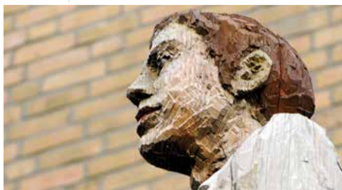
Stephan Balkenhol »Mann mit weißem Hemd und schwarzer Hose« [Man with White Shirt and Black Trousers], painted wood, installed 2007.

» Location: Georgsplatz (adjacent to the Deutsche Bundesbank)