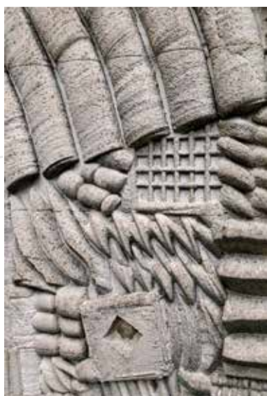
Werner Schreib »Monument für Reisende« [Monument for Travellers], cast concrete, installed 1965.

» Location: Friedrichswall (NORD/LB façade)