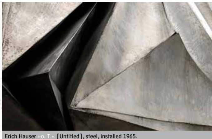
Erich Hauser »o. T.« [Untitled], steel, installed 1965.

» Location: Friedrichswall (façade of the Maritim Hotel)