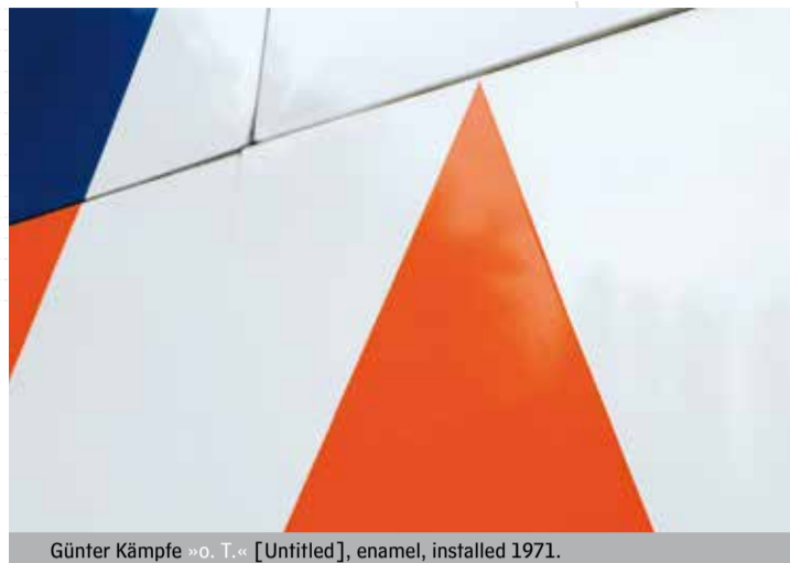
Günter Kämpfe »o. T.« [Untitled], enamel, installed 1971.

» Location: Theodor-Lessing-Platz (on the rear of the Maritim Hotel)