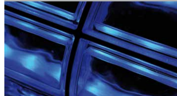
Francesco Mariotti »Licht-Kunst-Bänke« [Light Art Benches], glass and steel, installed 2005.