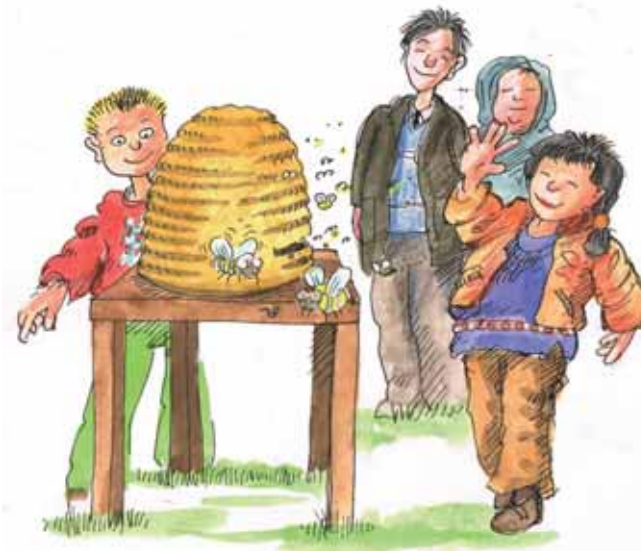
excursions to extracurricular places of learning, e.g. visiting the Schulbiologiezentrum