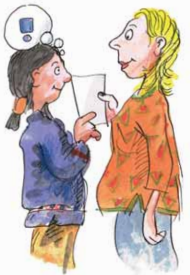
Talk with each other – talking and asking questions