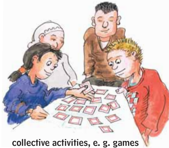
collective activities, e. g. games