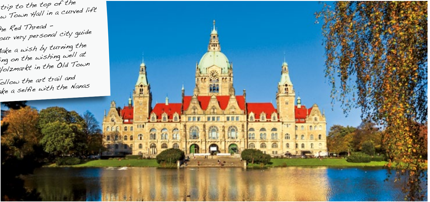
New Town Hall