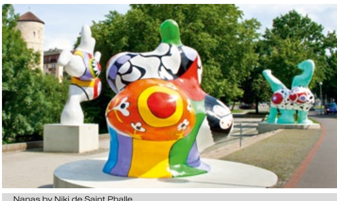
Nanas by Niki de Saint Phalle